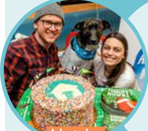
Adopted on Animal Planet live TV show!