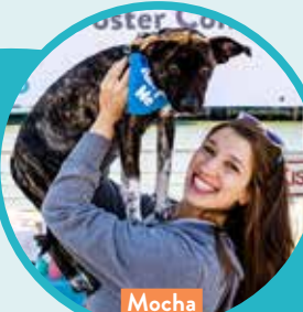
Mocha attended many of our events!