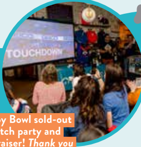
Puppy Bowl sold-out watch party and fundraiser! Thank you BARK, Wisdom Panel, and Boris & Horton