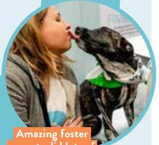
Amazing foster parents did lots of puppy training!