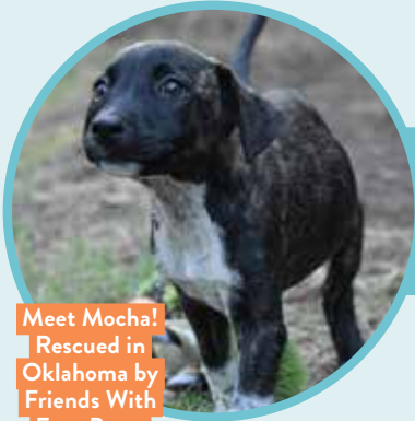
Meet Mocha! Rescued in Oklahoma by Friends With Four Paws.