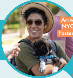
Arrival Day in NYC, joining Foster Dogs Inc.